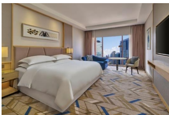
King Room with 1 king bed